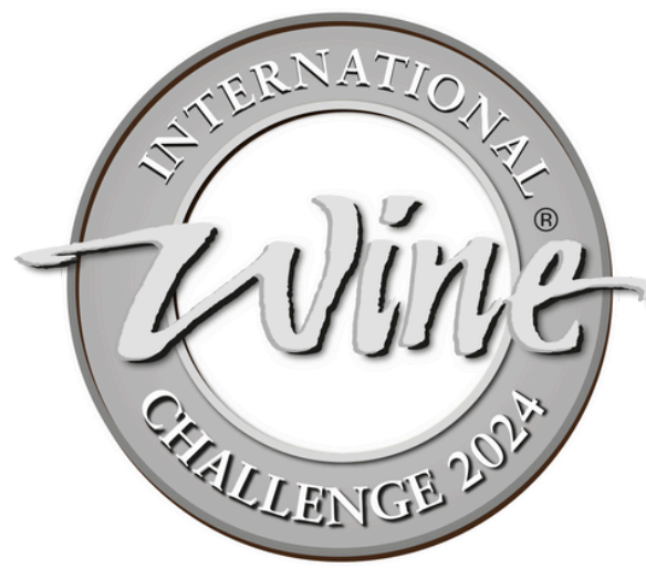
Dated Master Logo